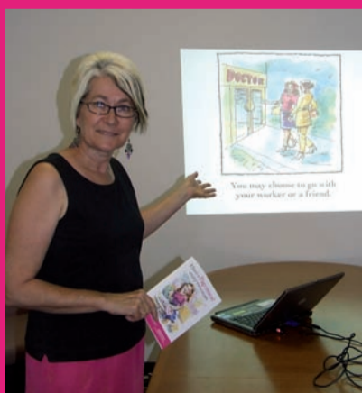
Presenter using Powerpoint