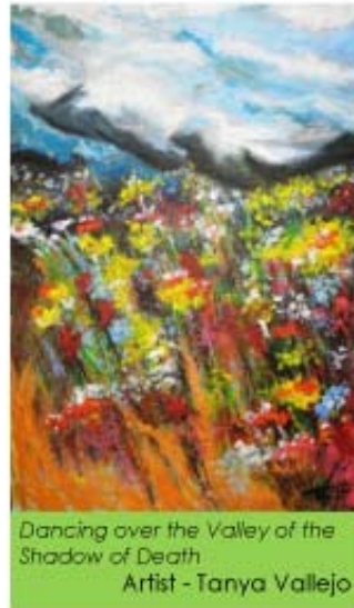
Joint Second Place