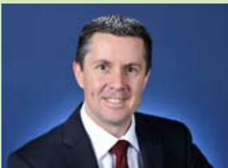
Hon Mark Butler MP

For the enthusiast - there is a lot of information on Commonwealth directions in mental health at: